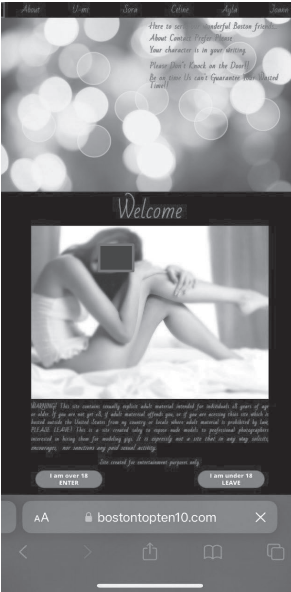
Figure 2: Screenshot of landing page