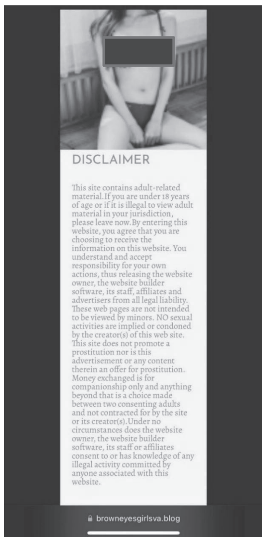
Figure 4: Screenshot of landing page