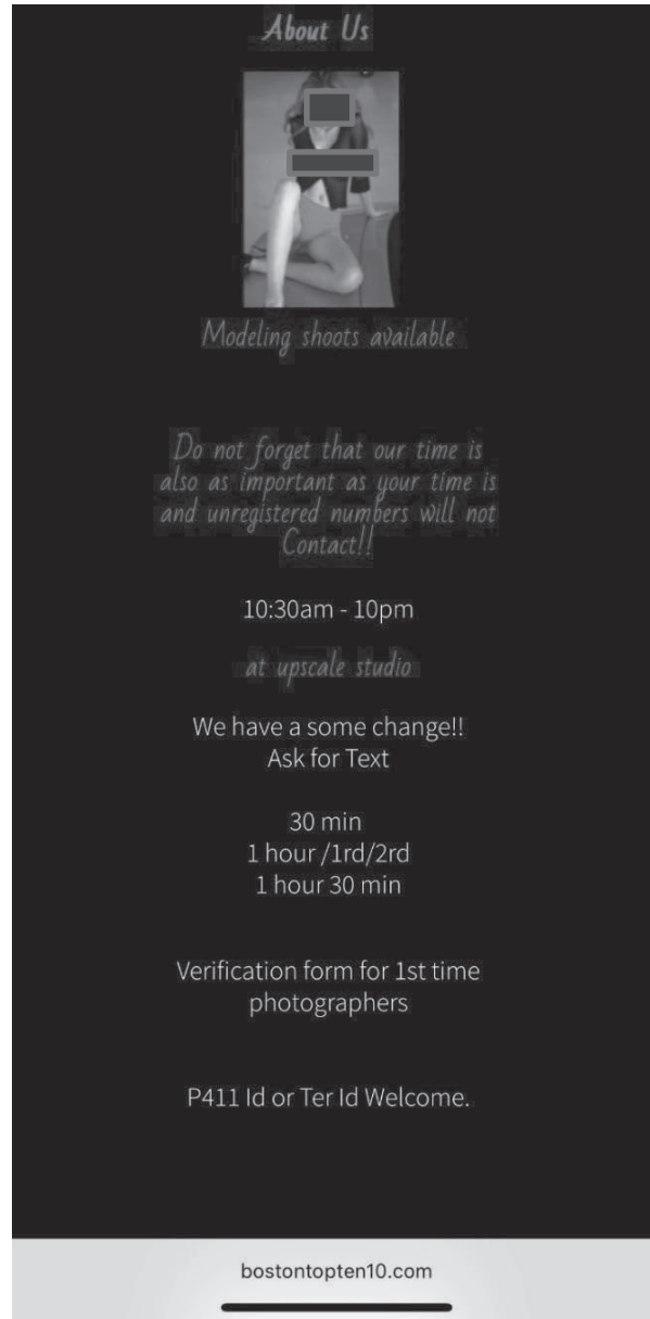
Figure 3: Screenshot of "About Us"

17. As depicted in Figure 3, the website lists times of services as “30 min;” “1 hour/1rd/2rd;” 9 and, “1 hour 30min.” The site typically advertises the services of three to five Asian women at any given time, though there are periods when less or more women are advertised. Women who have appeared on www.bostontopten10.com have also appeared on