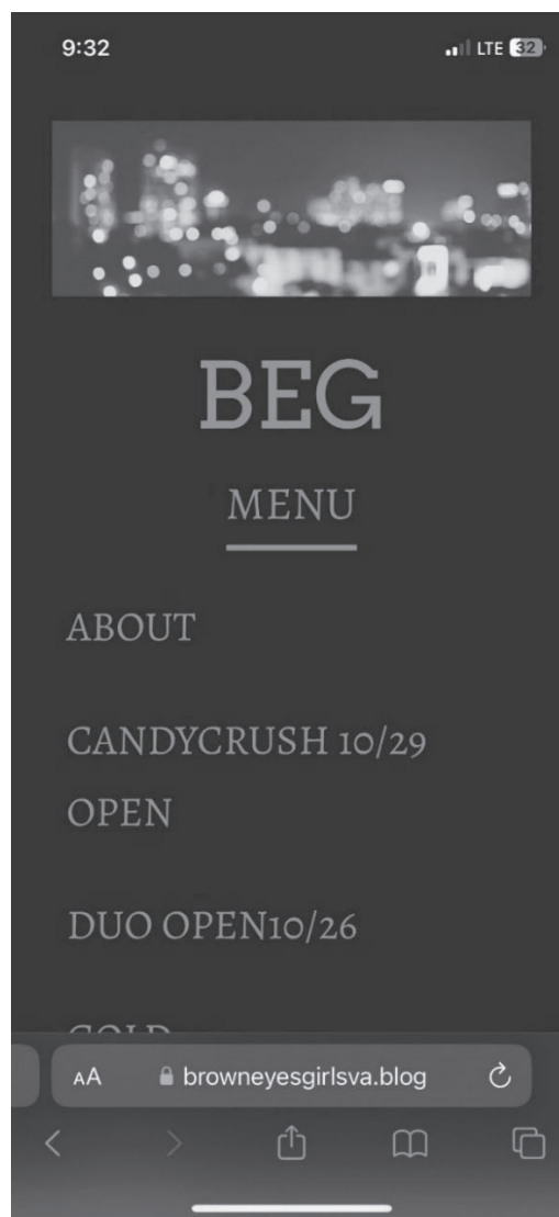
Figure 5: Screenshot of Menu

20. Like Boston Top Ten, the Brown Eye Girl website also lists the height, weight and bust size of multiple Asian women available for appointments and depicts nude and/or semi-nude photographs of each. The women available on the website are updated frequently. For example, on June 3, 2023, the website contained measurements for and nude and/or semi-nude photographs of “Haruka.” On October 20, 2023, the website’s contained measurements for and nude and/or semi-nude photographs and listed: “Fia-K”, “J.Naru/Hanako”, “La Sera” and “Rainbow Open 10/18.” Based on this, I believe that these were the women available for commercial sex for a fee on the date of October 20, 2023. I further believe that the website listed: “Rainbow Open 10/18”