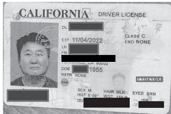
Figure 7: L.H.K. driver license